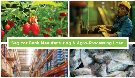
Sagicor Bank Manufacturing & Agro-Processing Loan